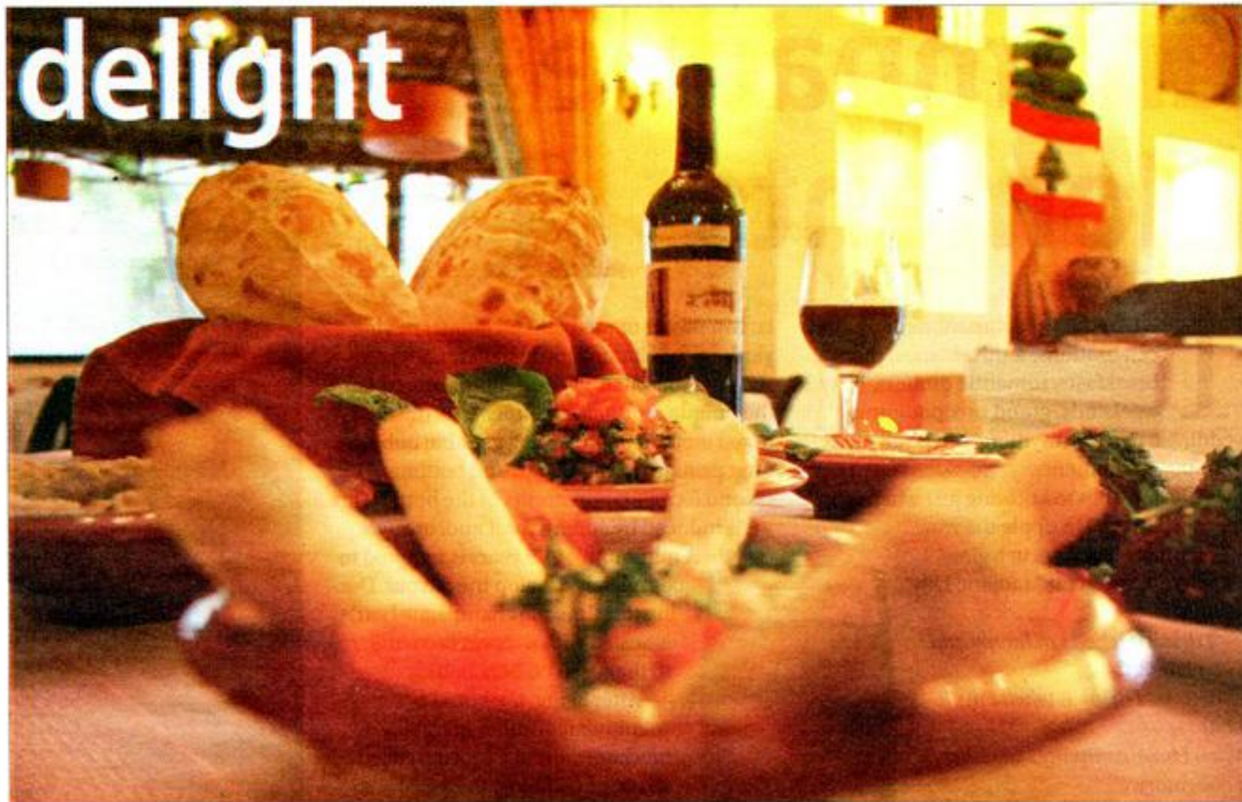
Dig in: Lebanese food is designed to be shared tapas-style. JESSE GAGE

Ihab, Le Cedre's manager, asserted that "Lebanese food is to be shared" – and indeed the meal is more than enough to completely fill two diners, in fact it could easily satisfy three or four.