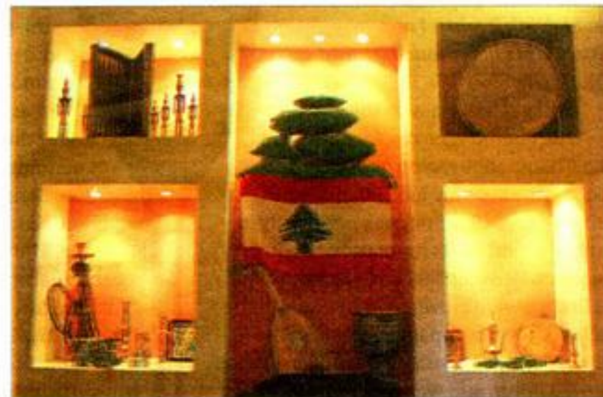
Hookah, line and sinker: A traditional Lebanese display.

If you are looking for an appetite-obliterating meal for $13 per head, look no further than Le Cedre.